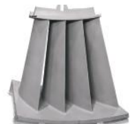
M701D - Vane Stage 4