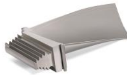
M701D - Blade Stage 3