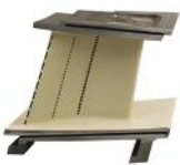
M701D - Vane Stage 1