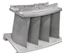
M701D - Vane Stage 3