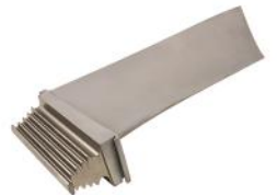
M701D - Blade Stage 4