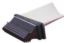
M701D - Blade Stage 2