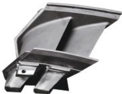
MTB14(H25) - Vane stage 1