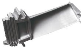
MTB14(H25) - Blade stage 2