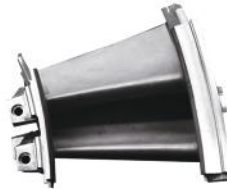
MTB14(H25) - Vane stage 2