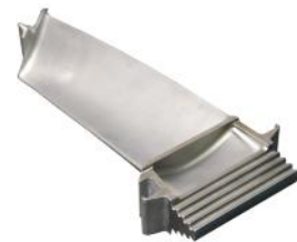
MTB14(H25) - Blade stage 3