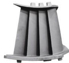
MTB14(H25) - Vane stage 3