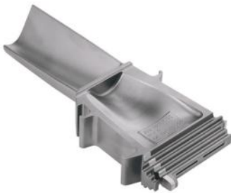
MGT40 - Bucket Stage 1