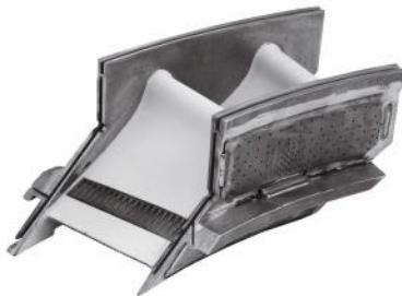
MGT40 - Nozzel Stage 1