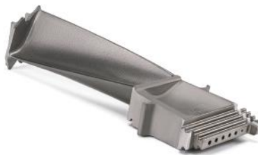
MGT40 - Bucket Stage 2