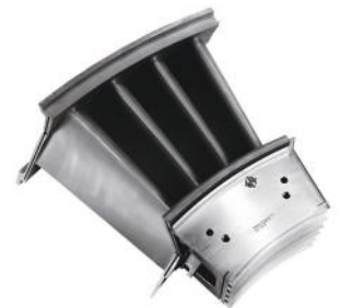
MGT40 - Nozzel Stage 3