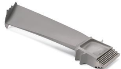
MGT40 - Bucket Stage 3