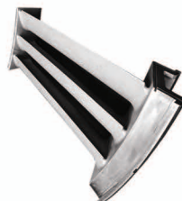
GT 13 E2 - Vane Stage 4