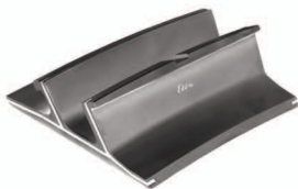
GT 13 E2 - Stator Heat Shield Row 1