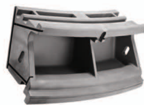
GT 13 E2 - Stator Heat Shield Row 3