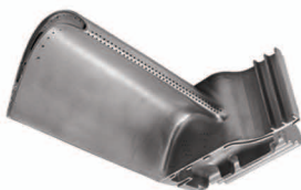
GT 13 E2 - Blade Stage 1