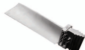
GT 13 E2 - Blade Stage 3