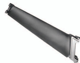
GT 13 E2 - Vane Stage 5