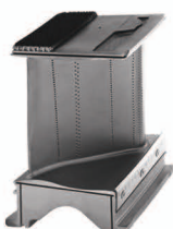
GT 13 E2 - Vane Stage 1