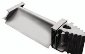
GT 13 E2 - Blade Stage 2